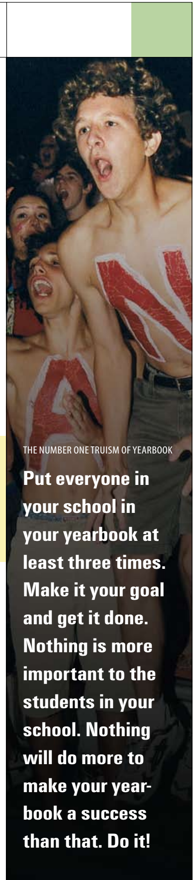
THE NUMBER ONE TRUISM OF YEARBOOK

Put everyone in your school in your yearbook at least three times. Make it your goal and get it done. Nothing is more important to the students in your school. Nothing will do more to make your yearbook a success than that. Do it!